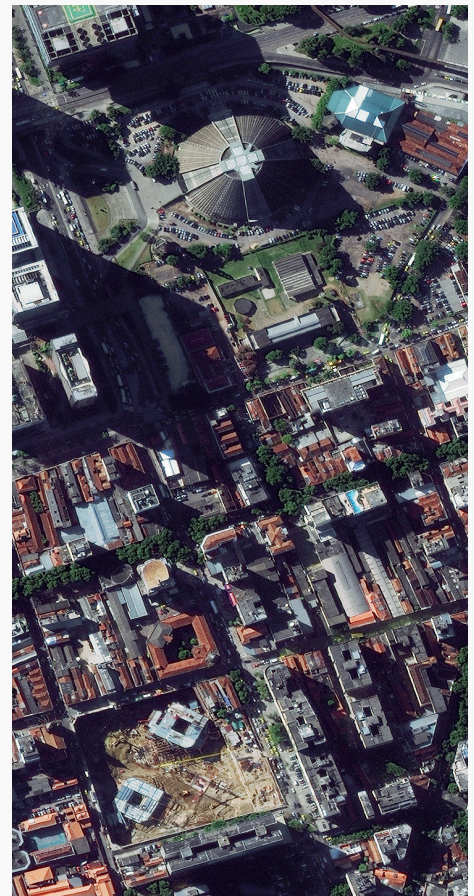
Rio de Janeiro, Brazil